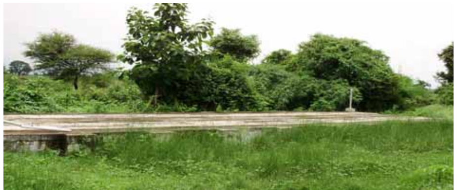
Technical layout of a DEWATS unit in Mekarsari Jaya, Indonesia (right) – constructed, good integrated DEWATS plant on a field (above) – Anaerobic unit of the DEWATS system under construction (left)

For over 15 years BORDA has led the way in innovative wastewater treatment facilities. Today, BORDA and its BNS Partner Network have already achieved the sustainable operation of more than 900 DEWATS solutions. This demonstrates that DEWATS AgroClean is a proven and affordable solution to combat wastewater problems in agro-industry enterprises. Total costs are based on load capacity and geography but basic units are below 10.000 €; all infrastructure will be based on locally available materials and labour.