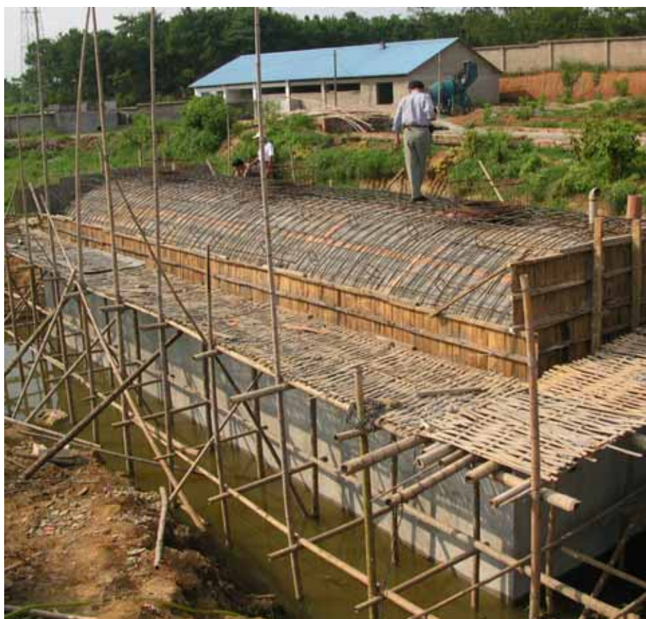
Left: AgroClean is ready for large-scale industries such as this alcohol distillery in Vietnam or at a pig farm in China (above)