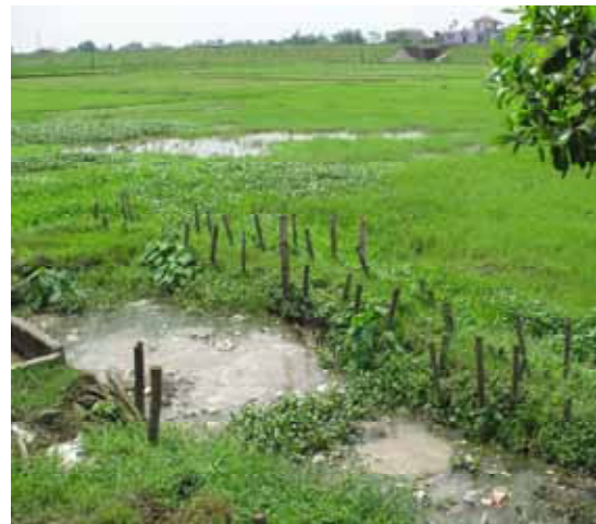
Waste dumped at a factory pollutes surroundings, contaminates drinking water, and causes complaints from neighbours

With a mission to improve the livelihoods of disadvantaged groups within societies and to sustain the functioning of eco-systems through dissemination of demand oriented Basic Needs Services (BNS), BORDA (Bremen Overseas Research and Development Association) and its BNS Partner Network develop and disseminate innovative solutions for facilitating the access to BNS.